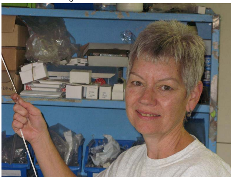
Click on image for complete story