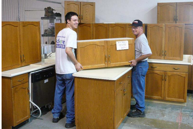
For More Information Click On Picture

The number one way homeowner's learn about our program is through word of mouth. So next time you hear of a friend, who is renovating their kitchen, don't forget to tell them to recycle that kitchen to the ReStore. It's a benefit to the homeowner, the environment, and our community. Kitchen recycling just makes sense!