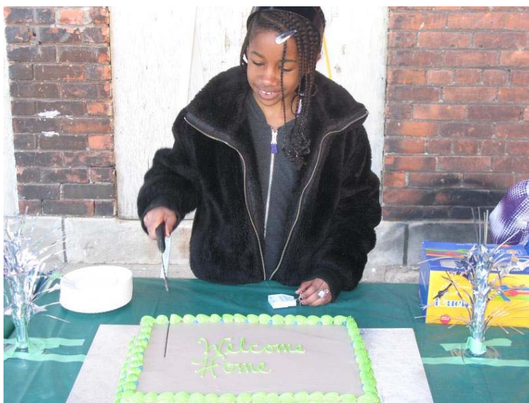
Welcome Home Celebration